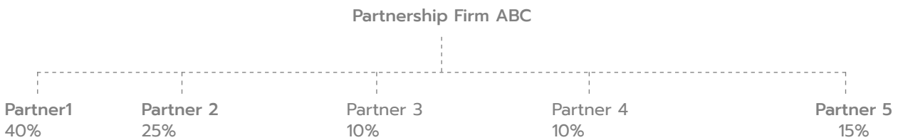
Illustration No. 2 – Partner ABC

For Partnership Firm ABC, Partners 1, 2 and 5 are considered as UBO as each of them holds >=15% of capital. KYC proof of these partners needs to be submitted including shareholding