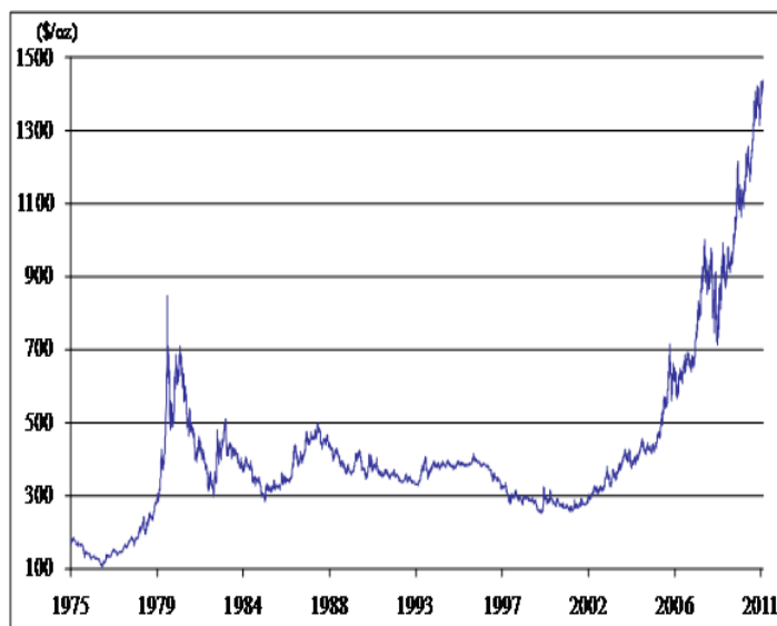
International Prices of Gold

Being one of the most valuable and universally accepted metals, the price of gold is a keenly watched factor in global economics. The prices are determined on the open market, but a procedure known as 'Gold fixing', that originated in London in September 1919 provides a daily benchmark figure